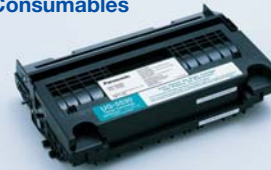
Toner cartridge UG-5530