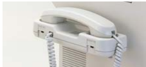
Handset Kit UE-403171